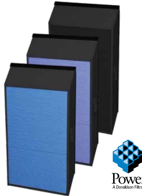
PowerCore® VH Filter Pack

(Also available in Flame-Retardant, Spunbond and Anti-Static)